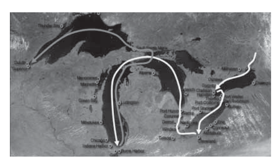
Typical transit of a transoceanic vessel on the Great Lakes: the inbound leg includes stops in Hamilton, Ontario; Cleveland, Ohio; and Burns Harbor, Indiana, where cargo is discharged and Great Lakes' ballast water is loaded, mixing with residual water in the ballast tanks. The inbound leg terminates in Lake Superior, where mixed ballast water is discharged along with surviving species—when outbound cargo is loaded in the Twin Ports of Duluth, Minnesota, and Superior, Wisconsin.

The committee identifies nine actions to reduce further ship-vectored AIS introductions. To avoid unacceptable delays, U.S. and Canadian organizations should undertake the recommended actions under expanded mandates, if necessary. In the committee's view, many of these actions could be implemented within the next 2 to 3 years if Canada and the United States exercise the necessary political will.