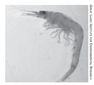
Bloody-red shrimp ( Hemimysis anomala), 1.5 in. in length, is native to eastern European seas, but was discovered in the Muskegon Lake channel in late 2006, and soon after in Lake Ontario.

The round goby was first reported in the Great Lakes in 1990. A bottom-dwelling fish, it is 4 to 10 inches long, eats voraciously, and reproduces rapidly.