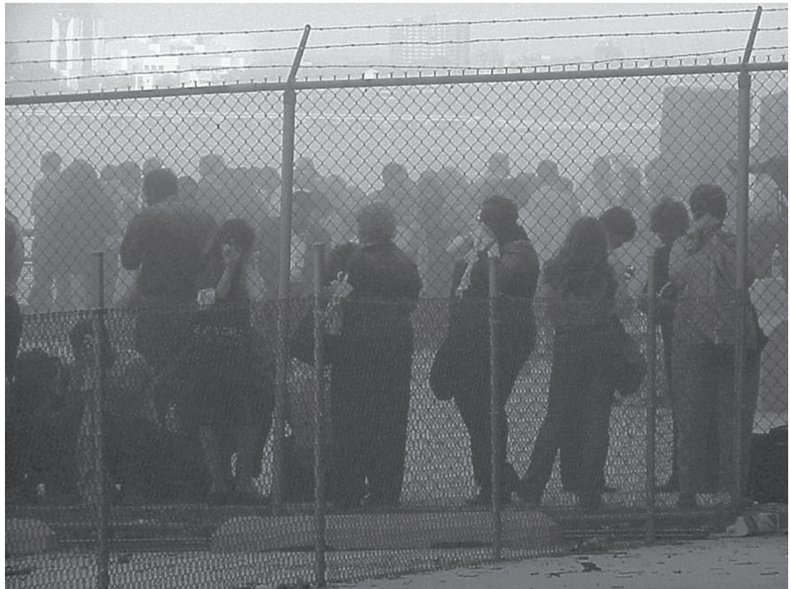
People in Manhattan's Battery Park await evacuation by ferries and buses after the September 11, 2001, terrorist attacks on the World Trade Center.

Transportation Research Board (TRB) Special Report 294, The Role of Transit in Emergency Evacuation , explores the roles that transit systems can play in accommodating the evacuation, egress, and ingress of people to or from critical locations in an emergency. The study was requested by Congress, funded by the Federal Transit Administration (FTA) and the Transit Cooperative Research Program, and conducted by a committee of experts appointed by the