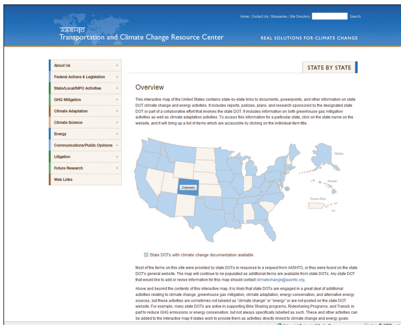
The AASHTO Transportation and Climate Change Resource Center's website features an interactive map of the climate change-related measures employed by state DOTs.