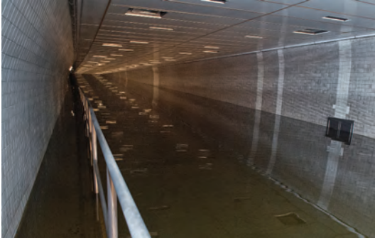
The Hugh L. Carey Tunnel, formerly known as the Brooklyn Battery Tunnel, flooded during Superstorm Sandy. Destruction and severe delays caused many transportation officials to reexamine emergency procedures.

Recent technology advances, such as lidar, have enabled states to inventory more than pavement data by including signs and other roadside features, as well as to incorporate additional functions, such as maintenance. Spreading the cost over several functions also ensures the necessary annual updating of the inventories.