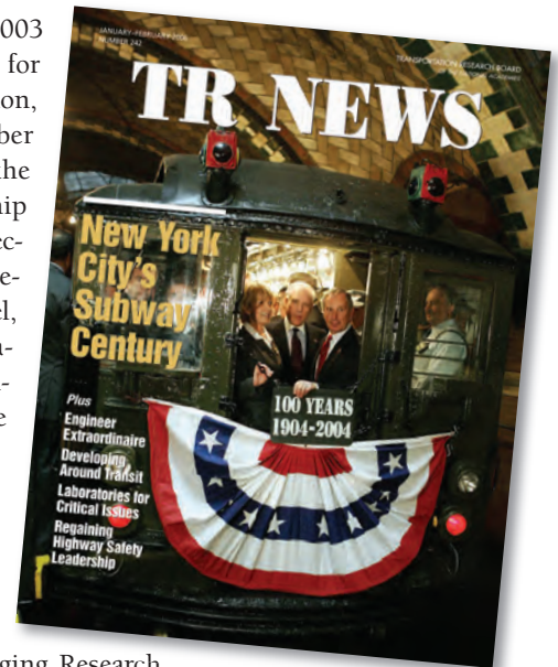
The January–February 2006 TR News featured articles on the 100th anniversary of the New York City subway system and on transportation engineer William Barclay Parsons. New York City Mayor Michael Bloomberg appears in the cover photograph in the center window, at the right.