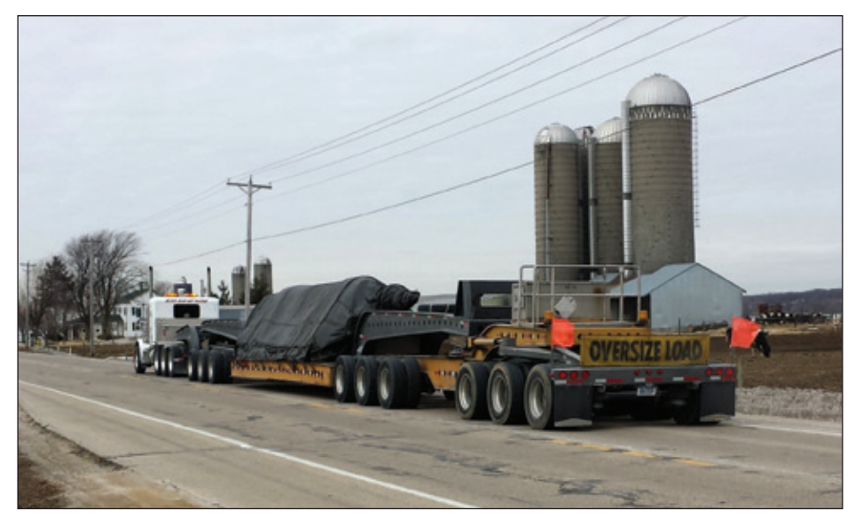
FIGURE 1 OSOW truck on STH-11 in Wisconsin.

OW permits. The route-matching algorithms succeeded in mapping 98.4% of all single-trip permits.